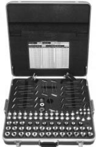
ALIGNMENT BUSHING KIT Pg T15