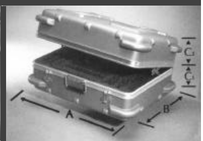
Capable of providing cases 24" deep for each lid for 48" total depth with overall dimensions of 54" x 82."