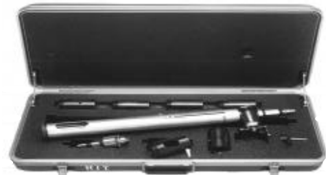
FEED & SPEED KIT Pg T11