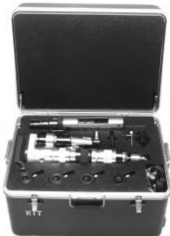
PIGGY-BACK KIT Pg T13