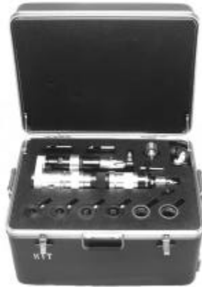
SUPER POWER FEED KIT Pg T5