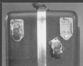
Heavy duty removable casters