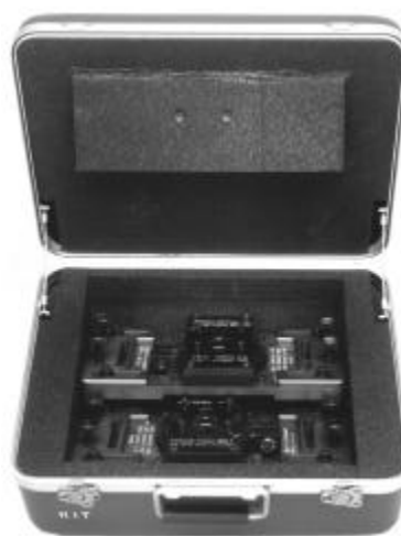
SWIVEL DRILL BARS KIT Pg T14