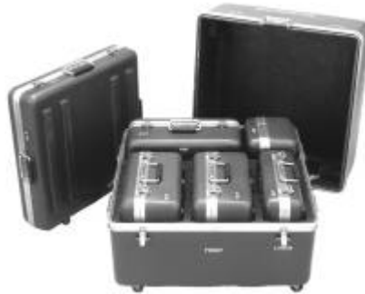
KIT STYLES Pg T2-T3