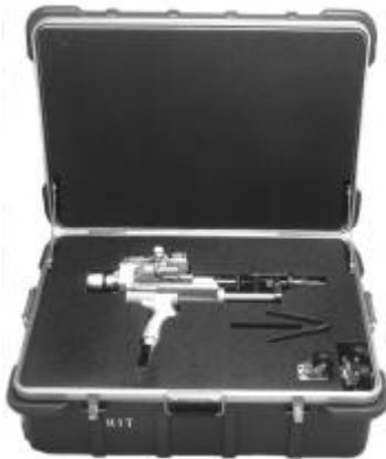
SPACEMATIC KIT Pg T6