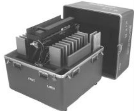
TEST FIXTURE KIT Pg T4