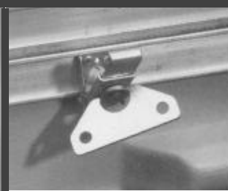
Quarter-turn latch with pressurized clamping