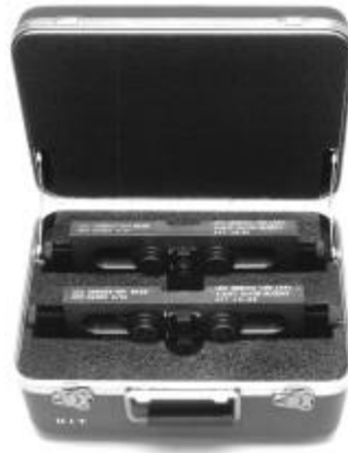
ADJ. DRILL BARS KIT Pg T7