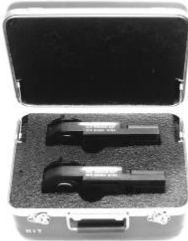
UNIVERSAL SWIVEL KIT Pg T9