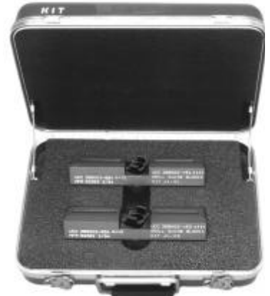
DRILL BARS KIT Pg T12