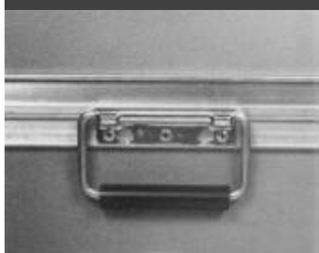
Self retracting handles with rubber grips